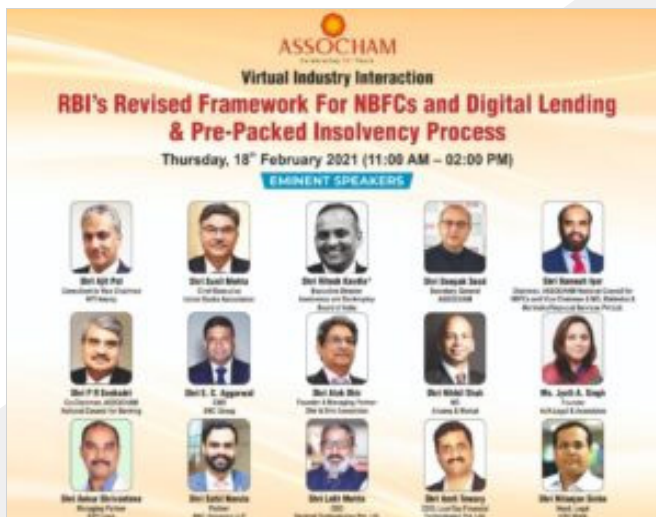
Speaking at ASSOCHAM's Virtual Interactive Session on RBI's Revised Regulatory Framework for NBFCs and Digital Lending & Pre Packaged Insolvency Resolution Process on 18th February 2021