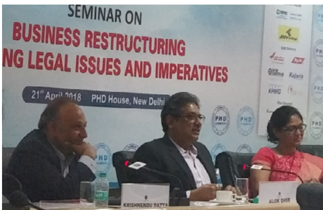
Seminar on Business Restructuring - Evolving Legal Issues and Imperatives organized by PHD Chambers of Commerce, New Delhi on 21st April, 2018