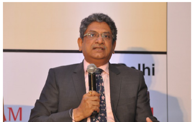
Addressed the topic "The Stressed Assets game is on - Are funds ready to play? Held on 14th November 2018 at The Leela Hotel, New DelhiPoint.