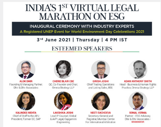
Speaking at India's First Virtual Legal Marathon on ESG held on 3rd June, 2021