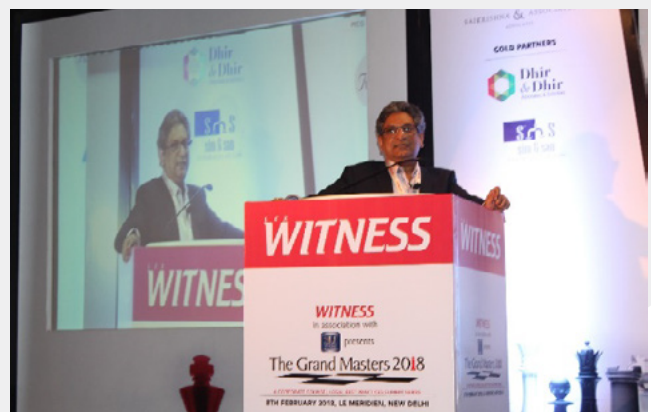
Lex Witness The Grand Masters 2018, Delhi held on 08 Feb, 2018 - the topic was "The IBC Trio - Debtors, Creditors, Bidders - Possible Peace?"