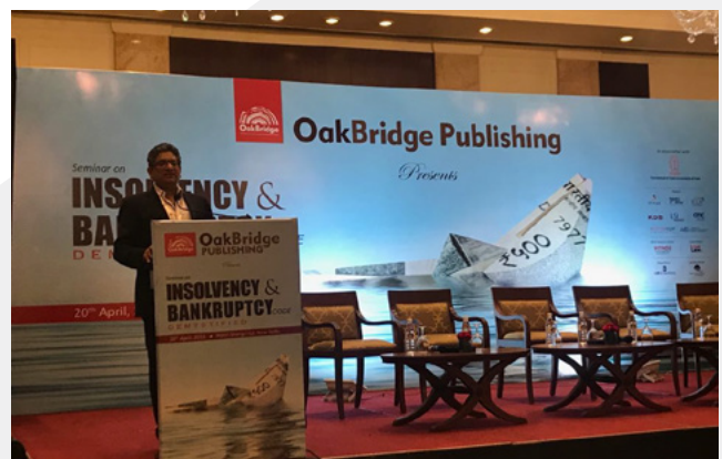
Keynote Address on The Concept of Insolvency Professionals: Advantages, Drawbacks and Solutions in a Seminar on Insolvency & Bankruptcy Code - Demystified at Shangri-La Hotels and Resorts, New Delhi on 20th April, 2018