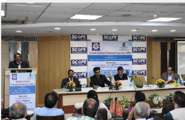
Conference on IBC-A Game Changer for Corporates & Professionals organized by All India Insolvency Professional Association (AIIPA) on 10th March, 2018