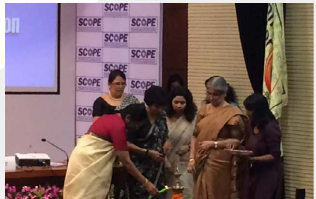
Inaugural function of Women in Law and Litigation (WILL)