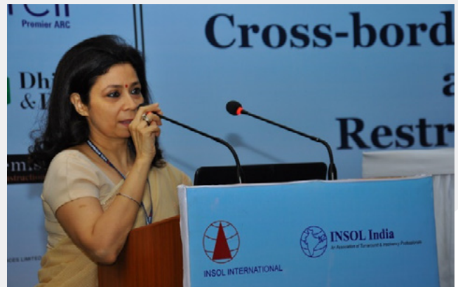
Seminar on Cross Border Insolvency and Restructuring by INSOL India, on 24th April 2016, New Delhi