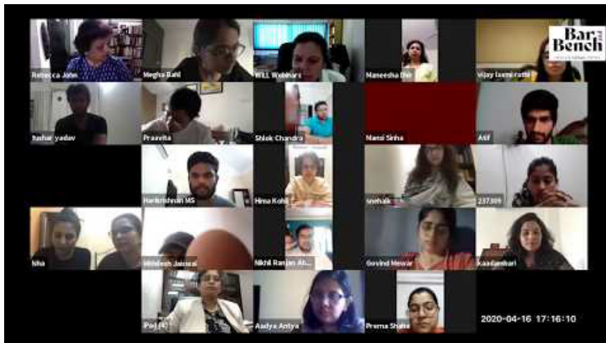
Speaking at the Webinar on The Art of Cross Examination in Criminal Trials by Women in Law and Litigation (WILL) on 16th April, 2020