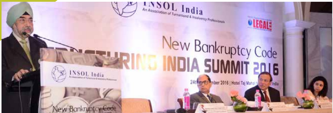
New Bankruptcy Code Restructuring India Summit, September 2016 by Legal Era and INSOL India