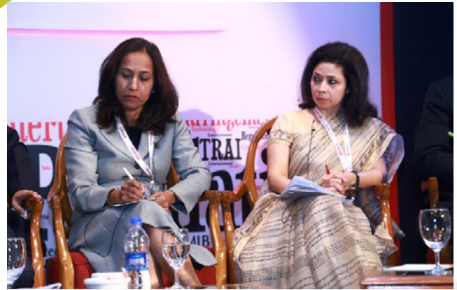
The Grand Masters 2015 (Media, Advertising & Entertainment Legal Summit) Witness - November 2015 - New Delhi