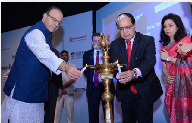
Seminar on Cross Border Insolvency and Restructuring by INSOL India, on 23rd April 2016, New Delhi