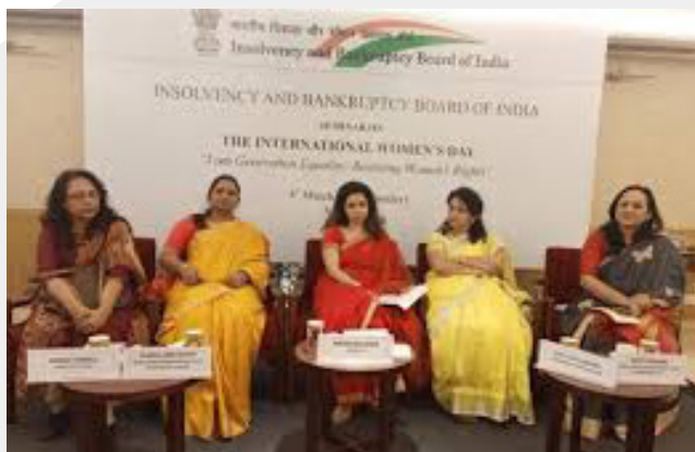
Chairing the Session at a Seminar on International Women's Day organized by Insolvency And Bankruptcy Board Of India on 8th March, 2020