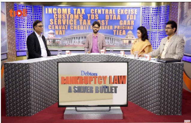
TAX India Online - Panel discussion on "Bankruptcy Code - Is it a game change?" https://www.youtube.com/watch?v=OHxuJuhk1IU