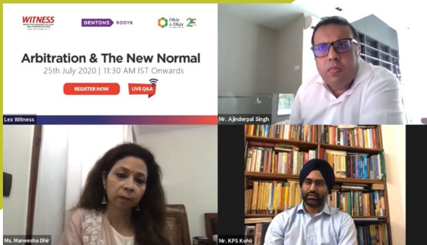
Addressing webinar on 'Arbitration and New Normal' by Lex Witness on 25th July, 2020