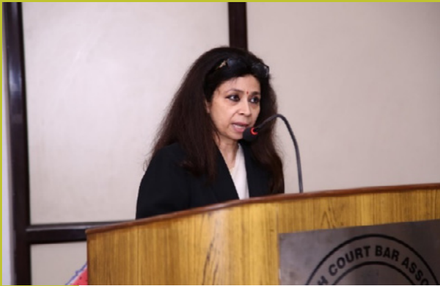
Panel session workshop on the Insolvency and Bankruptcy Code, 2016 organised by Women in Law and Litigation (WILL) on 26th September 2017 at the Delhi High Court