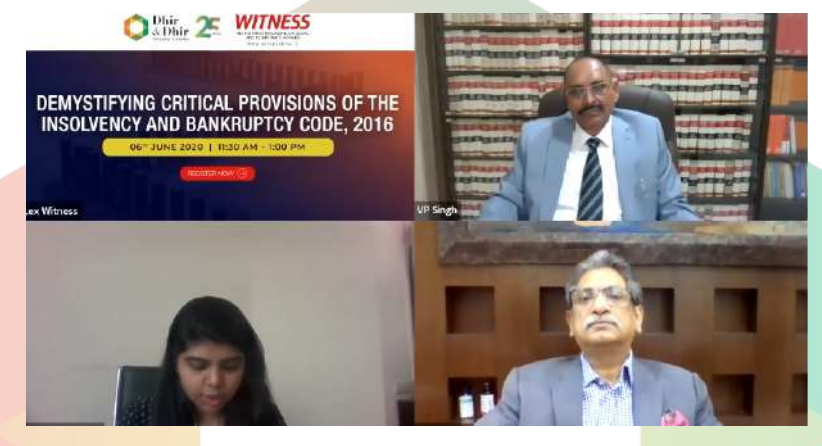
Addressing webinar on Demystifying Critical Provisions of IBC by Lex Witness on 6th June 2020