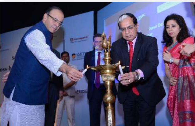
Seminar on Cross Border Insolvency and Restructuring by INSOL India, on 23rd April 2016, New Delhi