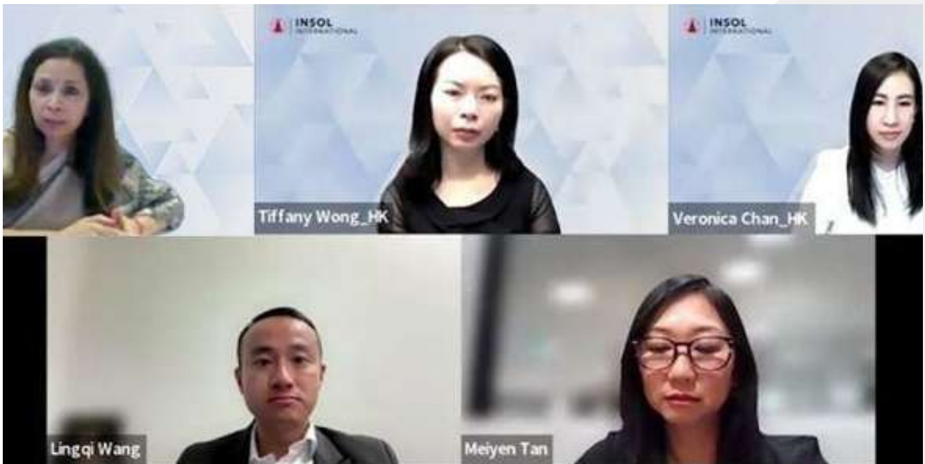
Speaking at Webinar titled INSOL Focus Webinar: Navigating cross-border insolvency recognition in Asia - Current Landscape and Future perspective organized by INSOL International