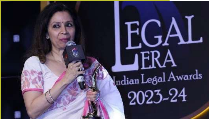
Recipient of 'Lawyer of the year - Insolvency & Restructuring' 2023-24 by Legal Era