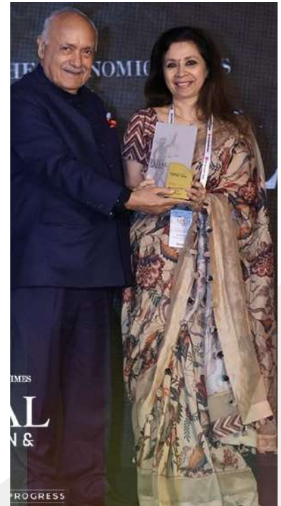
Recipient of 'Managing Partner of the Year (Female) 2023' by The Economic Times