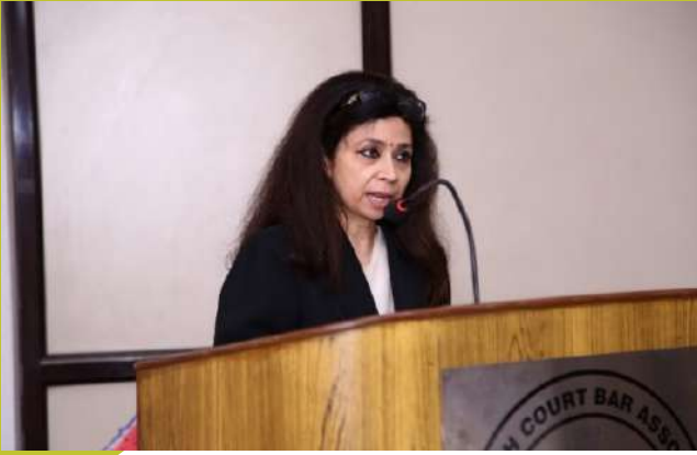
Panel session workshop on the Insolvency and Bankruptcy Code, 2016 organised by Women in Law and Litigation (WILL) on 26th September 2017 at the Delhi High Court