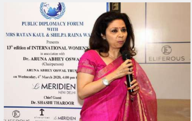
Recipient of 'Woman Lawyer of the Year 2020' Award by Public Diplomacy Forum