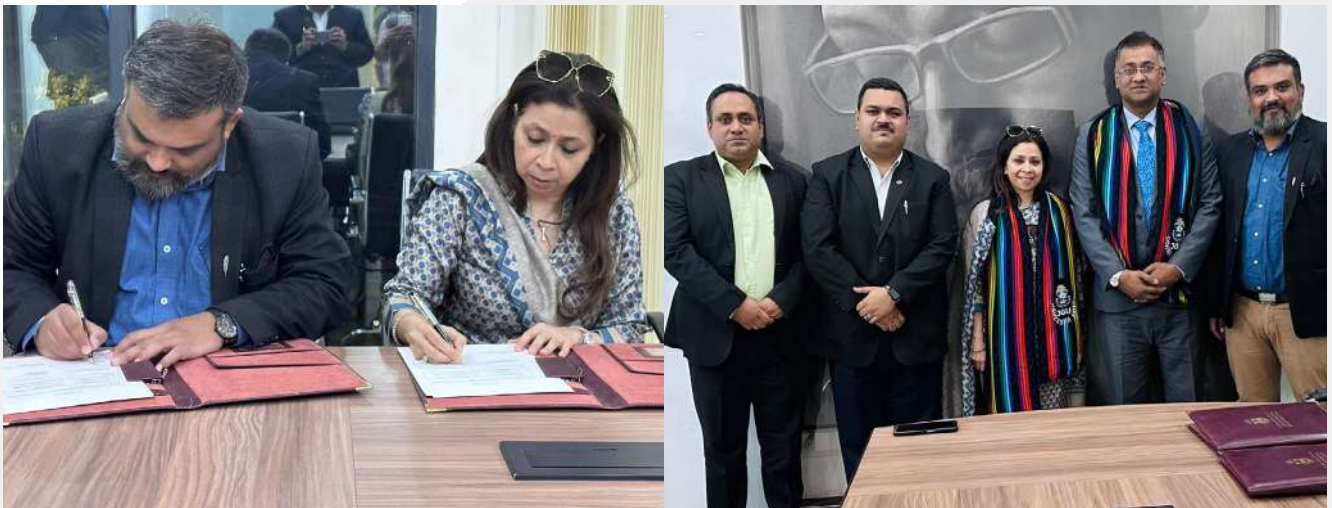
Collaboration with The Jindal Global Law school, O.P. Jindal Global University, Sonipat, Haryana for Career guidance, academic/industry sessions and internship opportunities