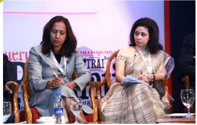
The Grand Masters 2015 (Media, Advertising & Entertainment Legal Summit) Witness - November 2015 - New Delhi