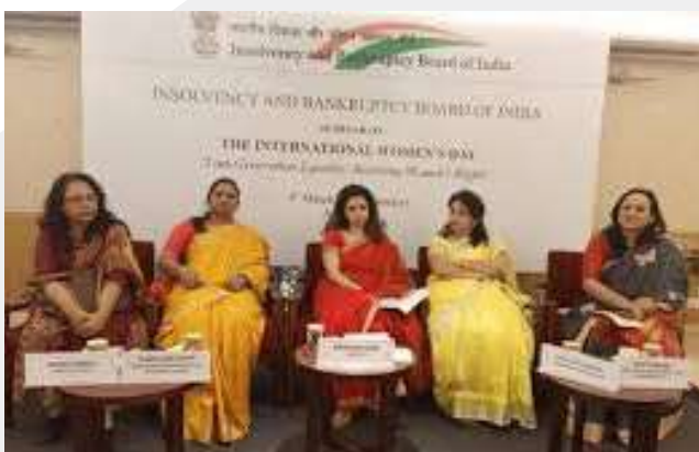
Chairing the Session at a Seminar on International Women's Day organized by Insolvency And Bankruptcy Board Of India on 8th March, 2020