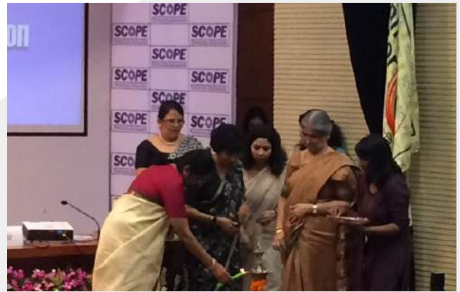
Inaugural function of Women in Law and Litigation (WILL)