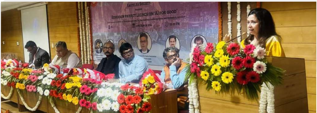
Guest lecture on Artificial Intelligence at Dr. Ram Manohar Lohiya National Law University campus, Lucknow on 19th March, 2024