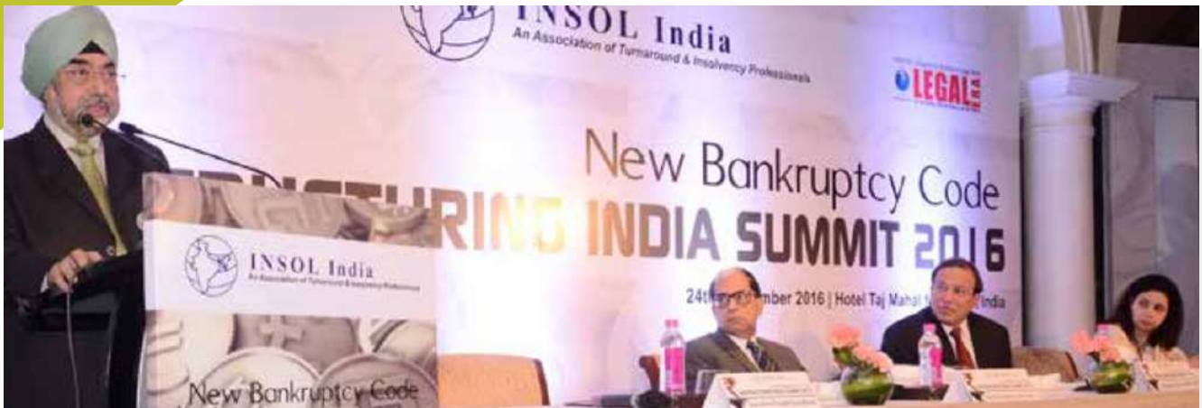
New Bankruptcy Code Restructuring India Summit, September 2016 by Legal Era and INSOL India