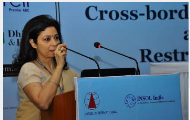
Seminar on Cross Border Insolvency and Restructuring by INSOL India, on 24th April 2016, New Delhi