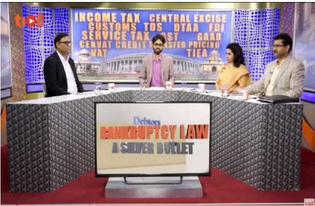
TAX India Online - Panel discussion on "Bankruptcy Code - Is it a game change?" https://www.youtube.com/watch?v=0HxuJuhk1IU